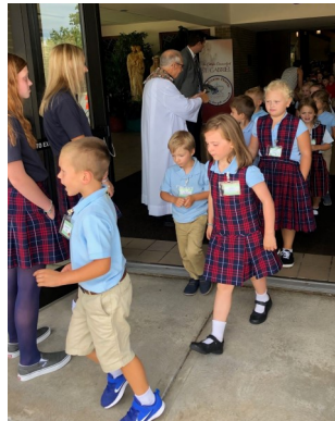
First Day of School Opening Prayer & Blessing